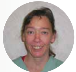
Recipe by Eunice Black