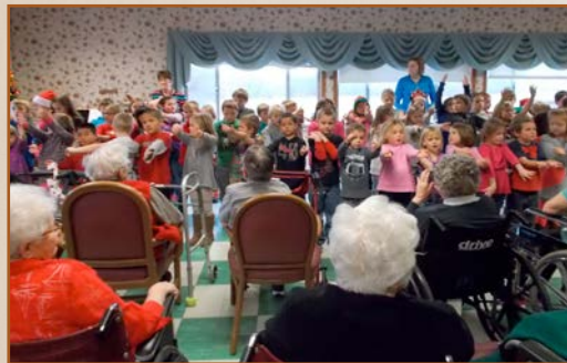
Doudna students entertain an enthusiastic crowd