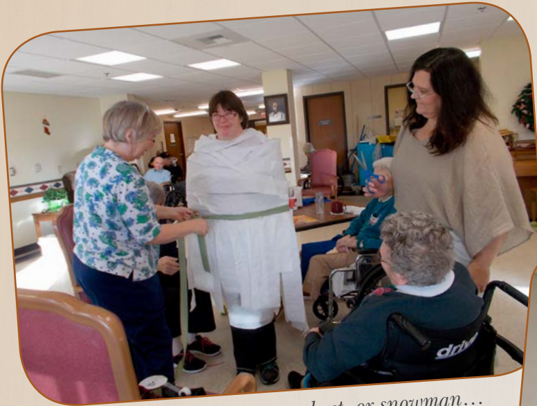
What will she be? Mummy, ghost, or snowman...