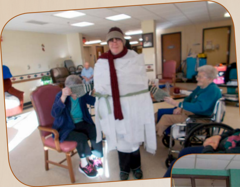
Tada!! Finished product. Yes – snowman.