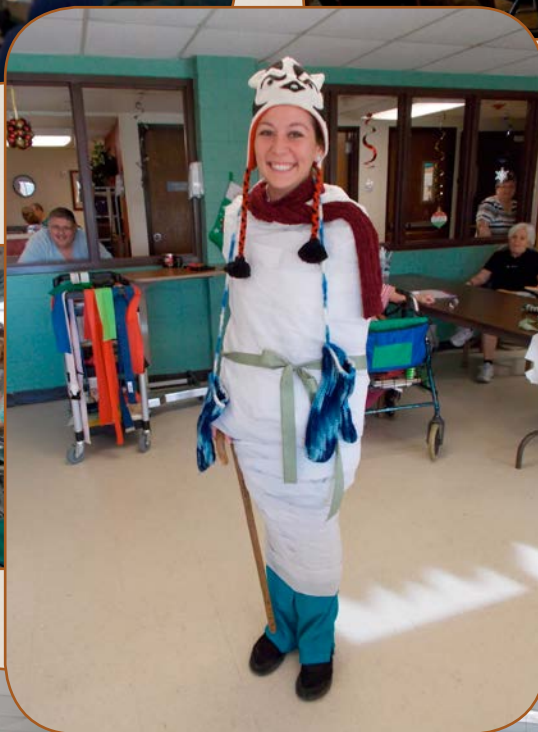
Staff had a blast coming up with ideas to dress someone up as a snowman (woman) as there was no snow to build a real one. Residents gave some great tips!