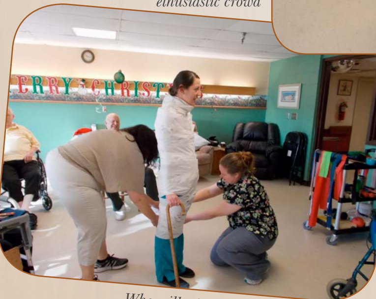
Who will win??