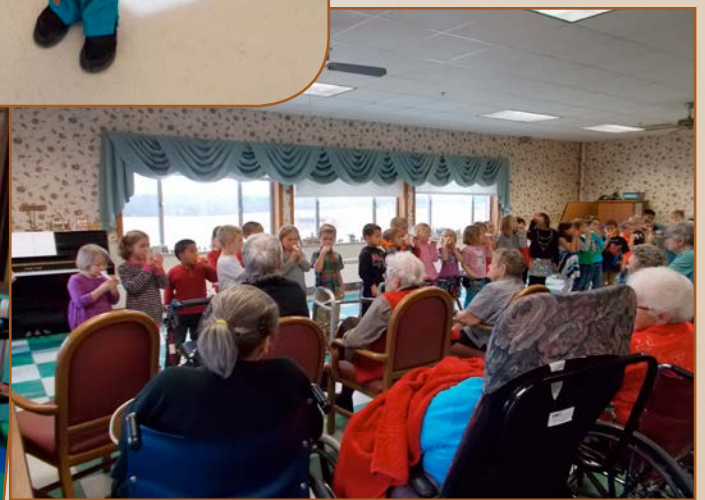
This talented group from Doudna impressed residents with their performance.