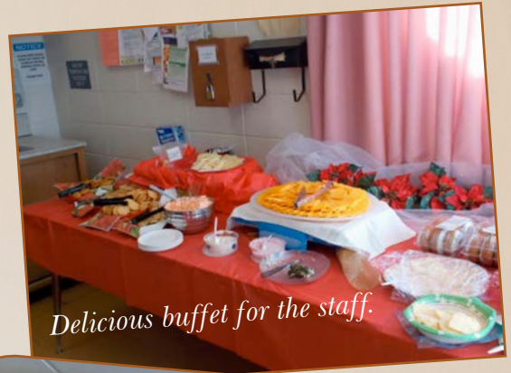
Delicious buffet for the staff.